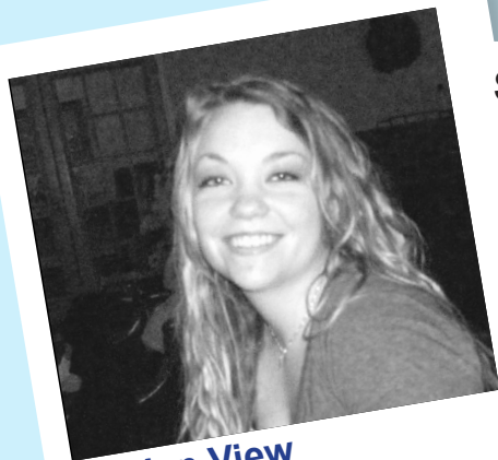
Golden View Healthcare Intern